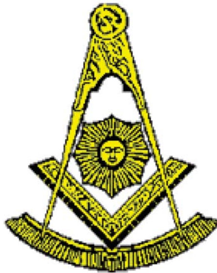
The Compass, Square, Sun, and Quadrant

The oldest known Past Master's Symbol consists of the Compass, Sun, Square and Quadrant. This is the most popular Past Master's Jewel used in the United States. The earliest written evidence that a Past Master's jewel in this form was used can be found in an exposé of Masonry published in April of 1760 entitled Three Distinct Knocks which said, "The Pass Master Hath the Compasses and Sun with a Line of Cords About his Neck."